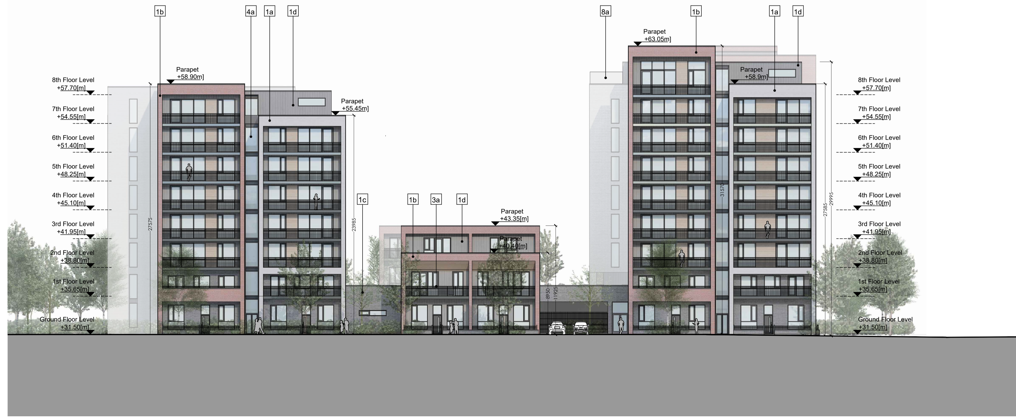
North Elevation - Block 2 Scale 1:200 @A1

WILSON ARCHITECTURE OMM | W 51 Patrick's Place, Wellington Rd., Cork t: 353-21-455255 e: info@wilsonarchitecture.ie 36 Pembroke Rd, Dublin 4 t: 353-1-6601866 w: www.wilsonarchitecture.ie